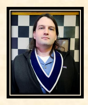
From the West