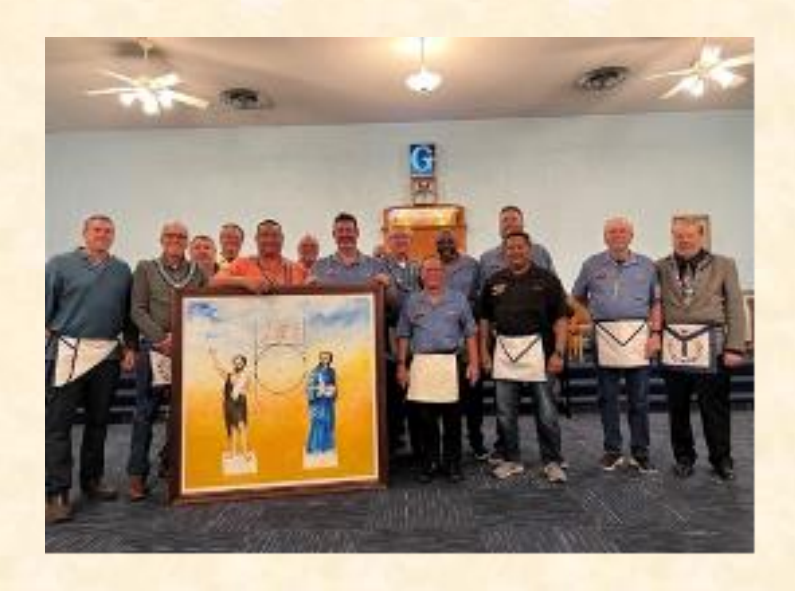
SANDY VALLEY FOOD DRIVE

In an effort to continue to reach back out to the local community in Sandy Valley, we started a Food Drive to collect Food and Cash donations to help stock the Keystone Food Pantry in Sandy Valley. For the year we have supplied over $15,000 in food and supplies to the Food Pantry.