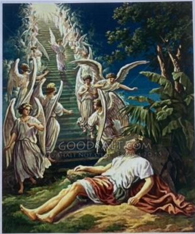
ESTEBAN MURILLO: Jacob's dream