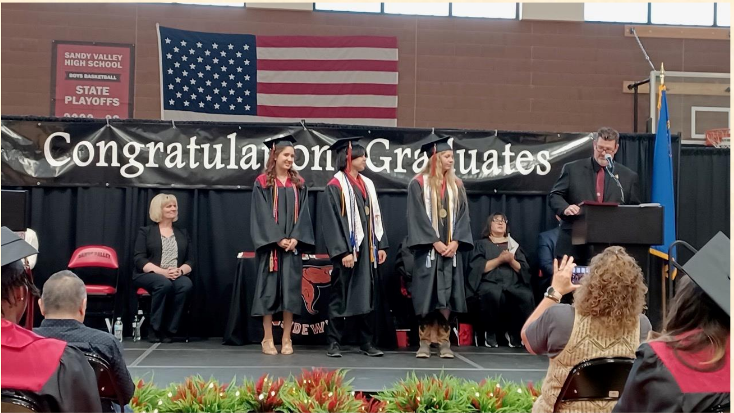
SANDY VALLEY HIGH SCHOOL GRADUATION AWARDING OF THE GEORD ODELL MASONIC SCHOLARSHIPS