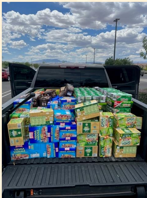
May Donation Run to Sandy Valley Food Pantry