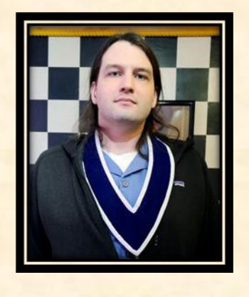
you wish to participate!