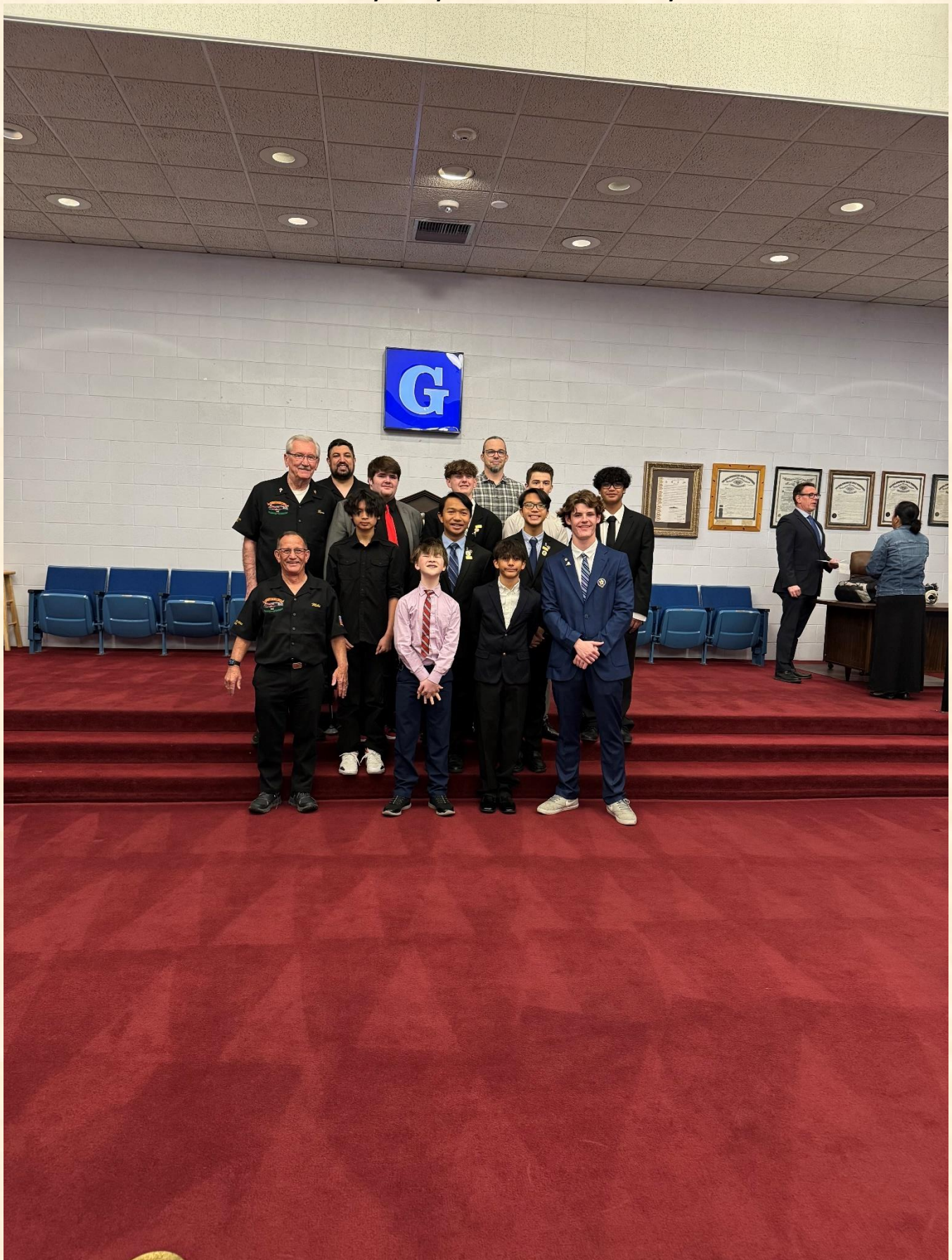
2025 Sandy Valley Official Visit to DeMolay